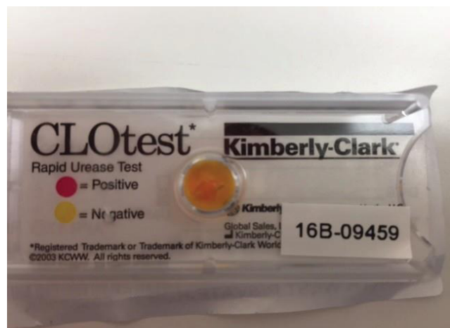
Figure CLO TEST -NEGATIVE